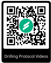
Drilling Protocol Videos